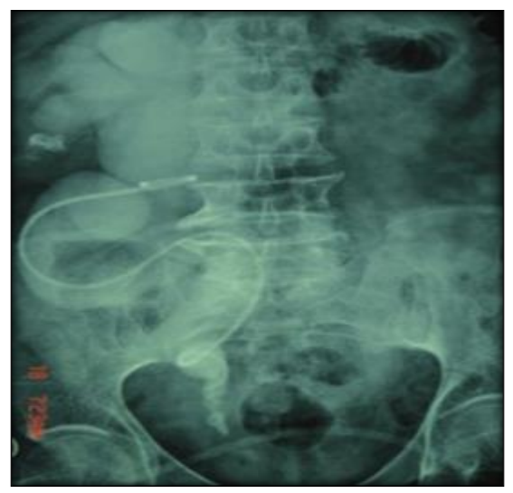
Abdominal radiograph showing a proximal migration of the right double-J stent