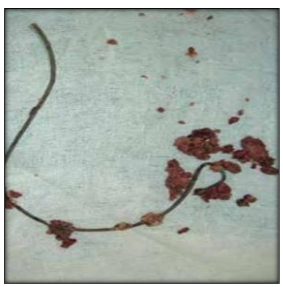
A double J stent with encrustation removed after ureterotomy