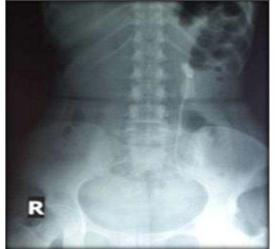
X-ray KUB showing broken DJ stent in situ on left side with upper end of DJ stent in situ with encrustations

Patients were evaluated for stent encrustation and associated stone burden by x-ray KUB, intravenous urogram and non-contrast CT [NCCT] abdomen. Majority of the patients had encrustation as evident by radiography. 2 patients had no or minimal encrustation whereas encrustation was limited to bladder alone in 6 patients, ureter alone in 5 patients. Encrustations involving kidney, ureter and bladder were seen in 2 patients. [Table 3]