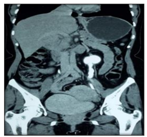
CT KUB showing broken DJ stent in situ on left side with upper end of DJ stent in situ with encrustations Figure 2: Images in present study